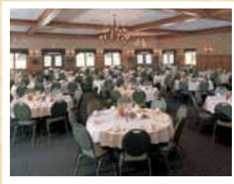
COL. JOHN KELLY ROOM 225 person capacity

Country Cupboard can provide your group with audio/visual equipment at a reasonable charge.