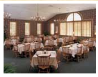
SLIFER ROOM 80 person capacity